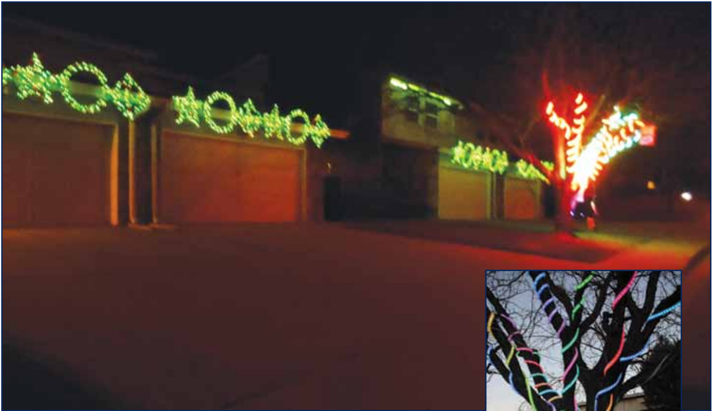
Heather Ridge was wrapped in colorful holiday light displays — CJ Baar (Fairway 16) puts up lights every year, he added more this year. The inset at right was taken of tree at dusk.