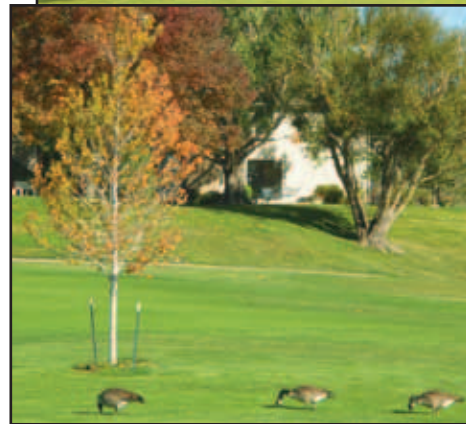
Fall colors are spectacular on the Heather Ridge Golf Course! Don't miss it!